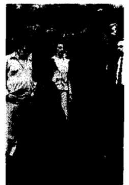
The Putnam Collection includes Tony Smith's Moses (top) and Picasso's Head of a Woman (middle). George Segal's Abraham and Isaac (bottom) is also a Putnam gift.